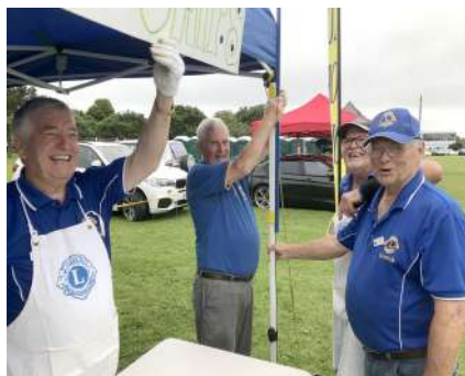
How many Lions does it take to erect a sign? Seems to be 4.

The weather Gods certainly looked down on them on Sunday as 24 hrs earlier it rained all day.