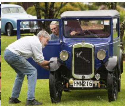
A real Old Timer Lovingly cared for.