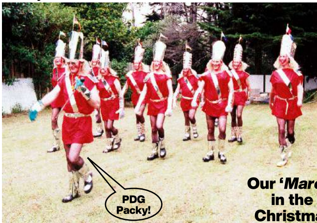
Our 'Marching Girls' in the Howick Christmas Parade

The organisation, transport, accommodation and the conduct of the convention, all were superb. The parade, with more than 12,000 participants from 100 countries, many in national dress, marching bands and spectacular floats, all gave a new meaning to our understanding of Lions International . As did the opportunities to meet with, and speak with, like-minded people from countries we may never have the opportunity to visit.