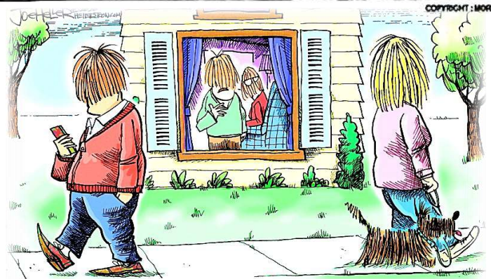
"The barber-shops better open soon; it's getting hard to recognise even best friends"