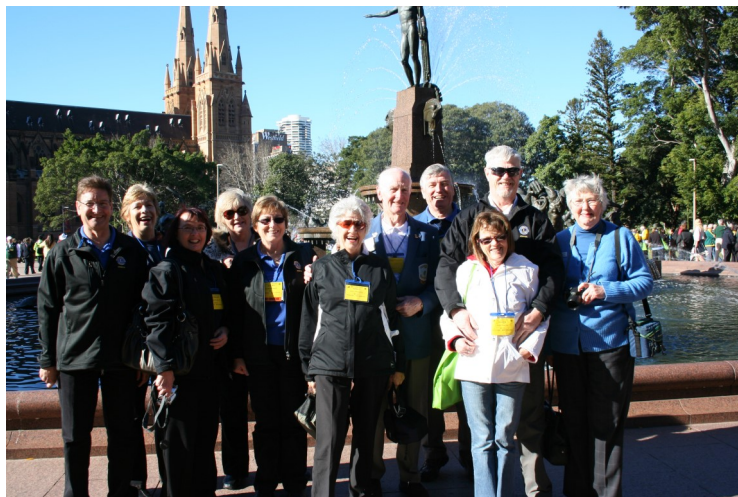
The Howick Lions Team in convention mode in the park a Sydney June 2010.

Ten members of the Club attended the International Convention in Sydney