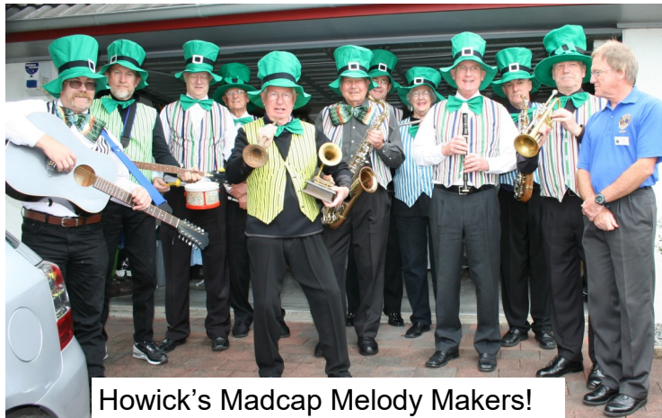
Howick's Madcap Melody Makers!

Once again the Fireworks display was well received and we were able to contribute $15,000.00 to the South Auckland Health Foundation Eye Service.