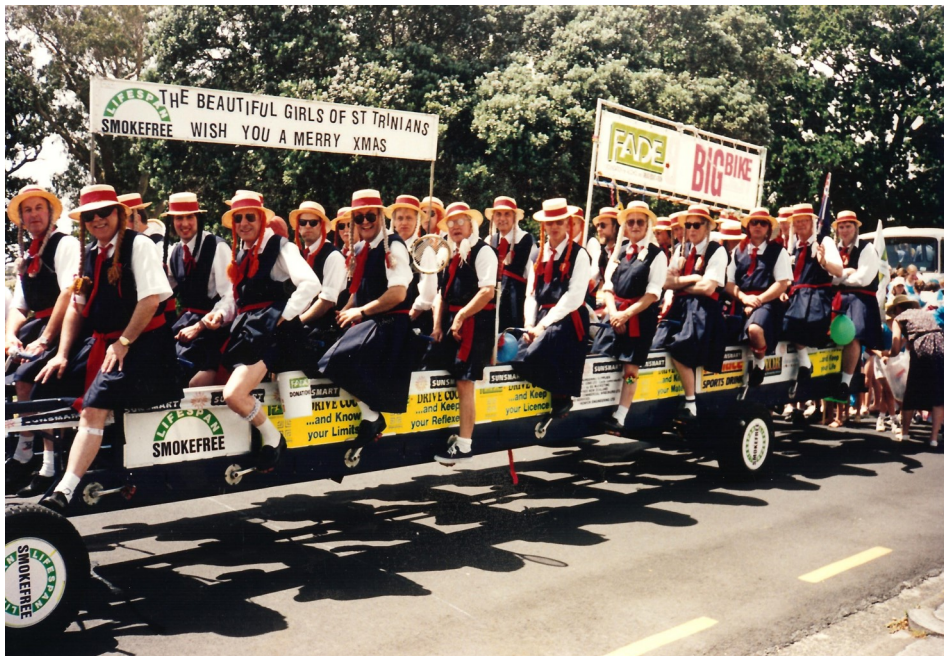
Our St. Trinians Girls perform in the Christmas Parade.