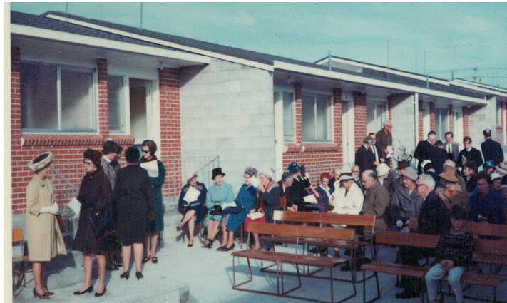
A group of the many visitors present at the formal official opening of "Westminster".